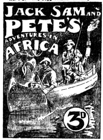
No. 1 of "The Boys' Friend" Library.